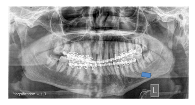
Fig. 1 Processing of the digitized image along a rectangular area of 10 \times 15 mm centered on the fracture line

area of 10 \times 15 mm was drawn along the center of the fracture line. The obtained densitometry values were expressed in gray levels from 0 to 256. Each of these values corresponded to the mean density of the fracture area (Fig. 1). In an attempt to eliminate intra-observer error, these measurements were performed twice by the same investigator who was unaware of the randomization codes. The data of the 2 trials were pooled, and the mean was included in additional statistical analysis. All collected data were then tabulated and statistically analyzed.